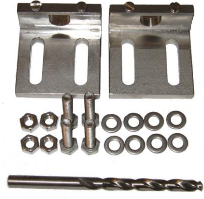
Steel Installation Kit