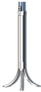
Hydraulic Borros-Type Anchors